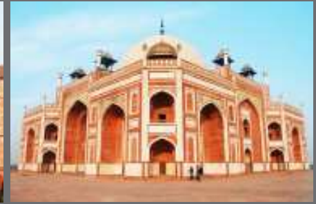
Humayun's Tomb, New Delhi