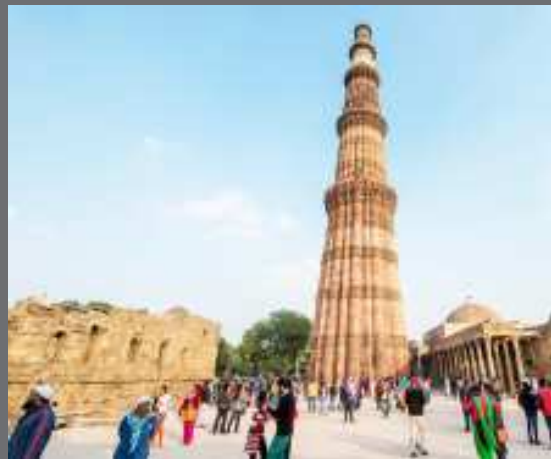
Qutub Minar, New Delhi