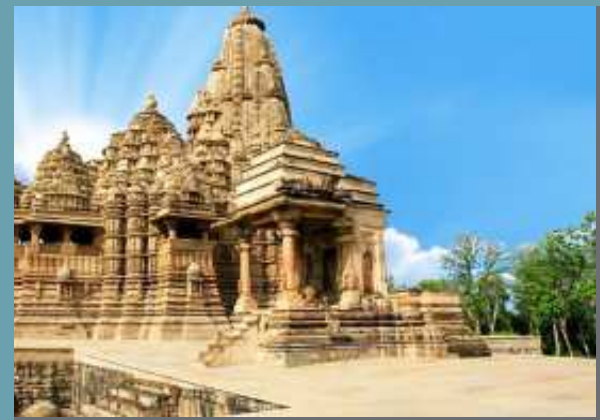
Khajuraho, Chhatarpur, Madhya Pradesh

Culture Minister Mahesh Sharma recently revealed the top revenue-generating monuments in the country between 2015 and 2018. How many have you visited? In recent years, India has grown exponentially in the tourism industry. Tourism contributes nearly 9.4% of the country's GDP and supports 8% of its total employment. While sectors such as medical tourism have prospered in the recent past, India's rich cultural heritage continues to be a stronghold for the sector. Culture Minister Mahesh Sharma recently revealed the top revenue-generating monuments in the country between 2015 and 2018. How many have you visited?