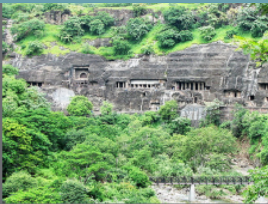
Ajanta Caves, Aurangabad, Maharashtra

Culture Minister Mahesh Sharma recently revealed the top revenue-generating monuments in the country between 2015 and 2018. How many have you visited? In recent years, India has grown exponentially in the tourism industry. Tourism contributes nearly 9.4% of the country's GDP and supports 8% of its total employment. While sectors such as medical tourism have prospered in the recent past, India's rich cultural heritage continues to be a stronghold for the sector. Culture Minister Mahesh Sharma recently revealed the top revenue-generating monuments in the country between 2015 and 2018. How many have you visited?