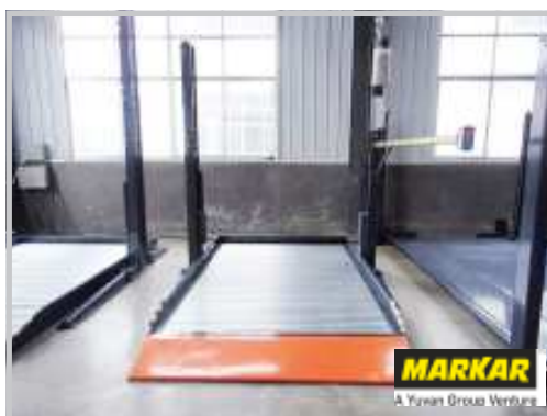
MARKAR – Automated Parking Unit