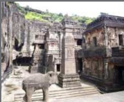
Ellora Caves, Aurangabad