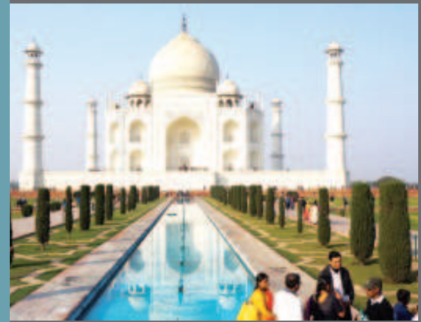
Taj Mahal, Agra, Uttar Pradesh