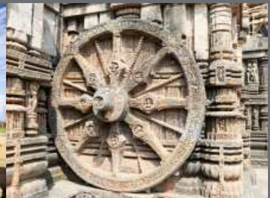
Sun Temple, Konark, Odisha