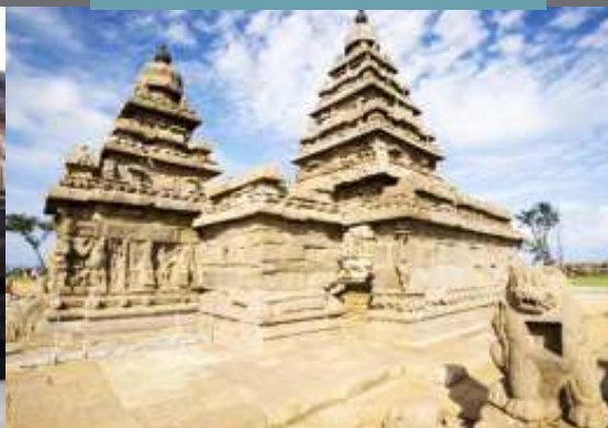
Mamallapuram, Kancheepuram, Tamil Nadu