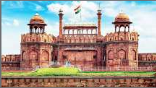
Red Fort, New Delhi