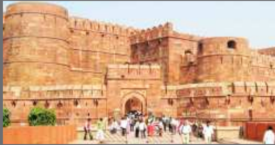
Agra Fort, Agra, Uttar Pradesh